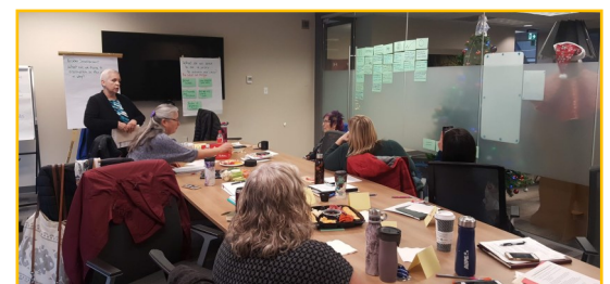
December 2019 Council Meeting

The Alberta PCAP Council participated in an all day facilitated Strategic Planning session on December 9, 2019 led by Alberta Community Development. Directors reviewed the PCAP Council's values, objectives, and overarching goals moving forward in an effort for the Council to best align with the vision of APCAP in the province and support agencies in their delivery of the PCAP program. The primary focus for goals included developing and expanding training and improving and facilitating communication practices.